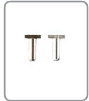
Accessories DF-2c Hammer Head Screw 2$