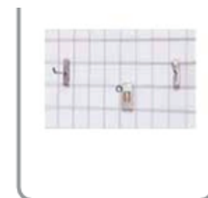
Steel Grid DF-24 20 Hooks 1830x610 45$