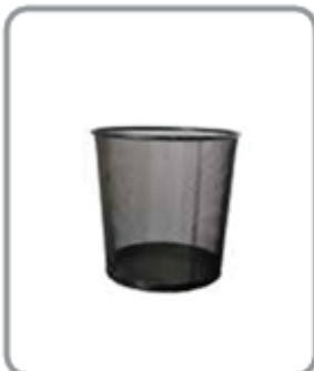
Waste Basket DF-29 6$