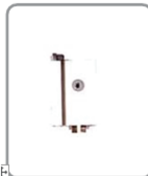
Accessories DF-2d Graphic Panel Retainer (1set-4pcs) 12$