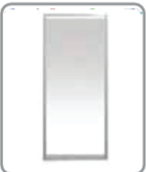
Wall Panel DF-28 Full Octanorm 1000x2500 32$