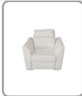
Sofa Seats DF-25f Single White 800X850X740 90$