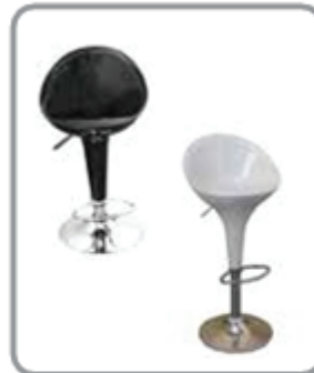
Stool DF-26d Bucket Type Black/ White 30$