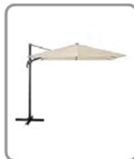
Umbrella DF-34 100$