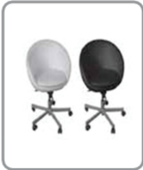
Chairs Revolving DF-4c b) Black/White 40$