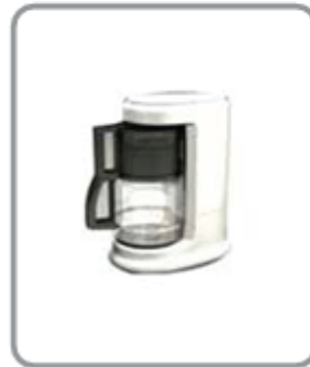
Coffee Machine DF-7b b) Percolator 30$