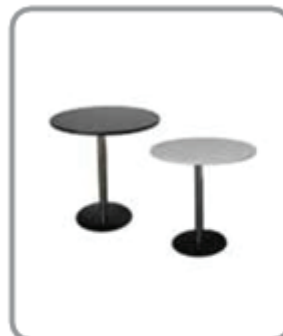
Table DF-27b Round Black/White 800x750 50$