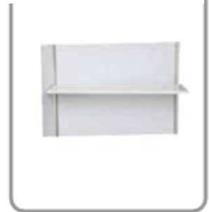
Shelf DF-21 Flat 1000x300 12$