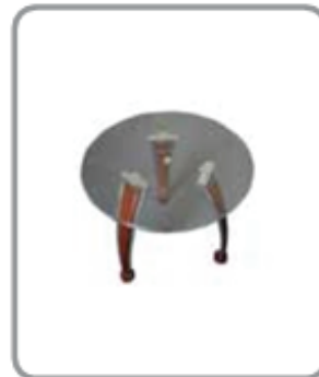
Coffee Table DF-8b Round Glass 45$ H-450x700dia