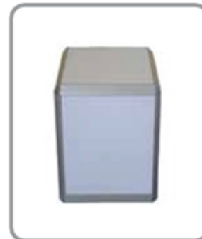
Podium DF-18b Exhibit base 500x500x750 40$