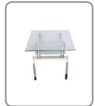
Coffee Table Square DF-8c Glass 50$ 600x600x520