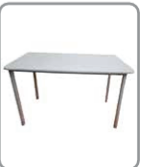
Table DF-27d Normal Rectangle 120x70x70 70$