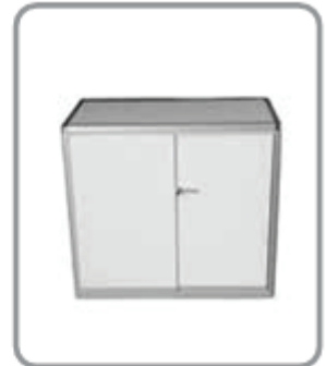
Free Standing DF-11 Lockable Counter (newline) 1000x500x900 52$