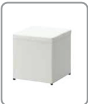
Bosnas Footstool DF-26f White 35x35x35 30$