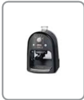
Coffee Machine DF-7a a) Espresso 100$