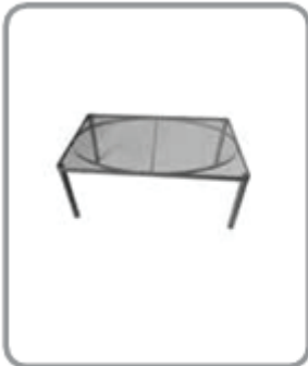
Coffee Table DF-8d Rectangle Glass 1100x630x400 60$