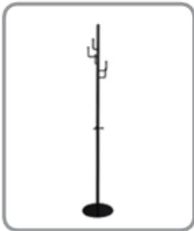
Coat Stand DF-6 30$