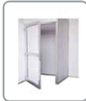
Door Solid Wooden DF-10 2000x1000 92$