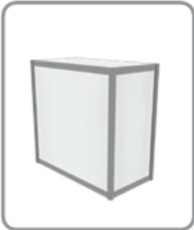
Free Standing DF-12 Lockable Counter (octa norm) 1000x500x1000 52$