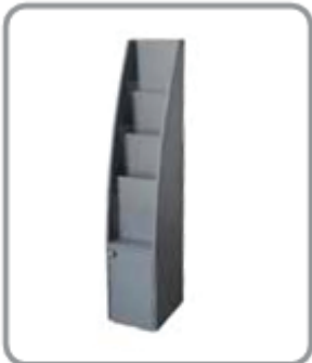
Literature Rack DF-14c Free Standing (Wooden) 4 x A4 45$