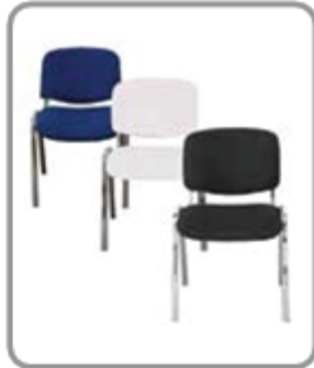
Chairs Standard DF-4d c) Black/White/Blue 20$