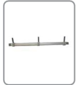
Coat Hook 1mtr DF-5 Octanorm (Wall Mount) 32$