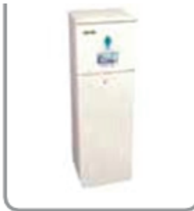
Refrigerator DF-19b Medium 590x530x1400 110$