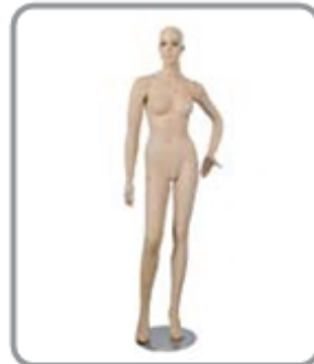
Manequin Adult DF-15 Female 120$