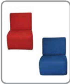
Sofa Seats DF-25a Red/Blue 820x570x750 55$