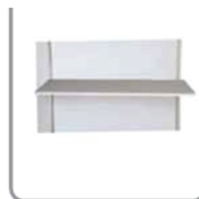
Shelf DF-22 Sloped 1000x300 14$