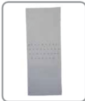
Pegboard DF-17 a)20 Hooks:1200x900 37$ b)30 Hooks:2400x900 60$