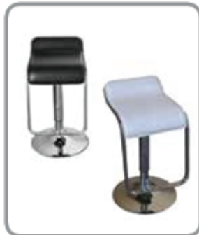
Stool DF-26c Leather Type Black/ White 35$