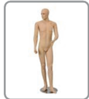
Manequin Adult DF-16 Male 120$