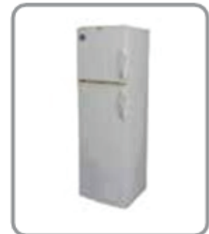
Refrigerator DF-19a Large 610x570x1600 170$