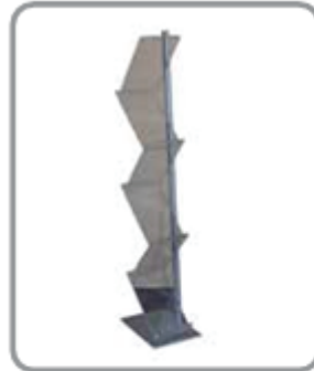
Literature Rack DF-14a (Acrylic) Zig Zag 4 x A4 50$