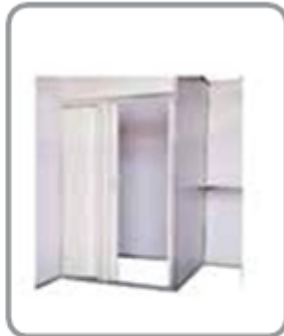
Door Folding DF-9 2000x1000. 60$