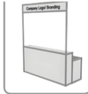
Registration Counter F-20 Free Standing (Octa norm) 2000x500x2500 250$