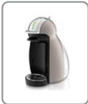
Coffee Machine DF-7d d) Nescafe Dolsto 75$