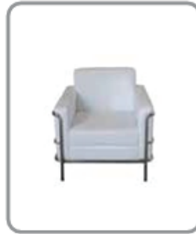
Sofa Seats DF-25c Single ibizu white 800x800x750 100$