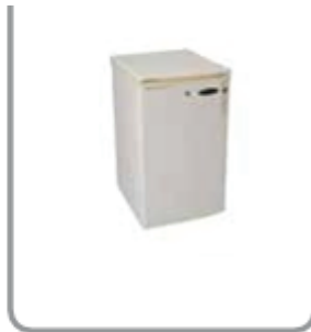
Refrigerator DF-19c Small 490x560x840 95$