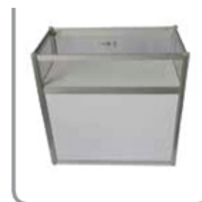
Showcase DF-23a Jewelry Showcase (octanorm) 1000x500x1000 80$