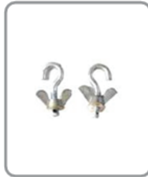
Accessories DF-2b Wing Nut Hook 2$