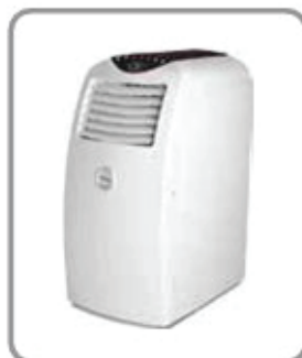
Portable AC DF-33 200$