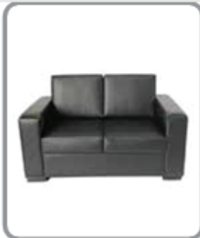
Sofa Seats DF-25e Double Black 1550x620x850 150$