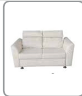
Sofa Seats DF-25f Double White 1550x620x850 150$