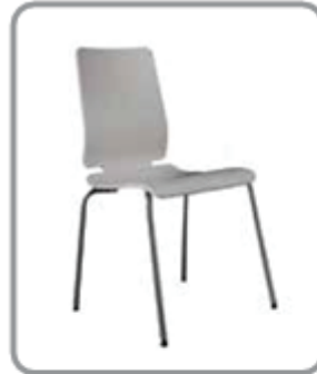
Chairs DF-4e d) white 30$