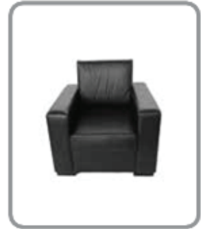
Sofa Seats Single DF-25d Black 800x850x740 90$