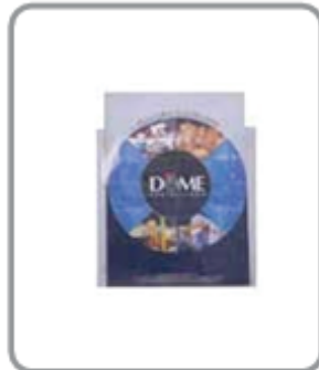
Literature Rack DF-14d Wallmounted 1 x A4 20$