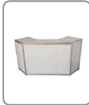
Info Counter DF-13 2500x500x1100 92$