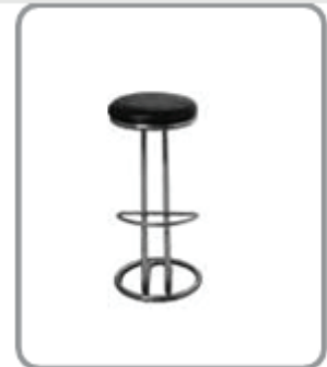
Stool High DF-26a Z-type with chrome leg 30$