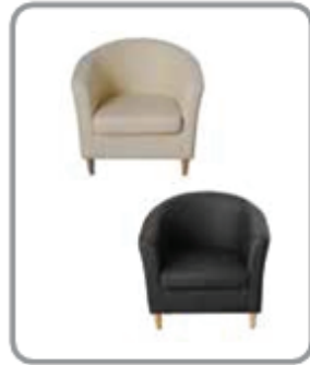
Sofa Seats DF-25b Coco Style Black/White 700x640x760 67$