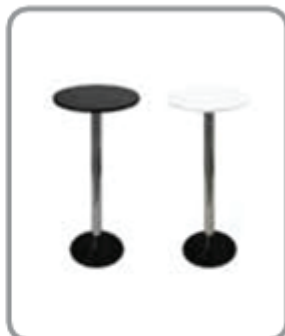
Table DF-27a High Bar Black/White 600x1200 55$