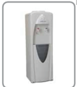
Water Dispenser DF-30 Hot/Cold 125$