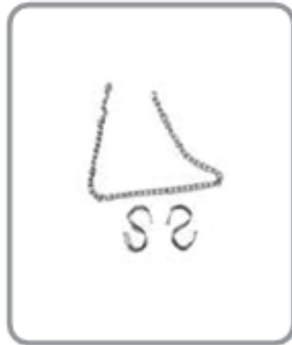
Accessories DF-2a Hook & Chain 6$