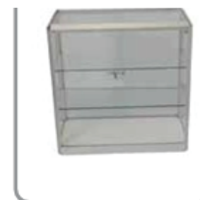
Showcase DF-23b Newline Single Case 1000x450x900 75$