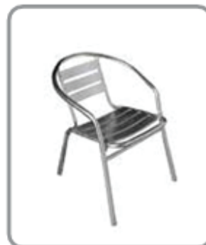
Chairs DF-4a a) Aluminum 20$