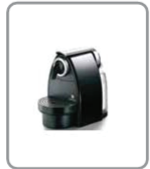
Coffee Machine DF-7c c) Nespresso 100$