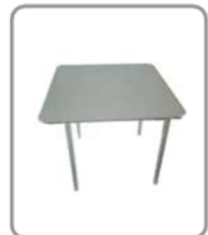
Table DF-27c Normal Square 70x70x70 50$