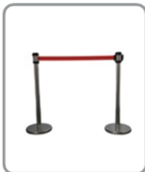
Barrier DF-3 (1 post with Ribbon) 40$