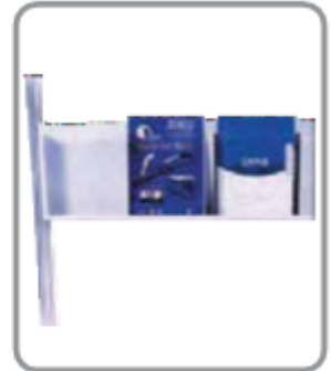
Literature Rack DF-14b Wall mounted (Octa norm) 4 x A4 50$