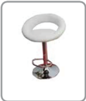
Stool High DF-26b White with chrome leg 35$