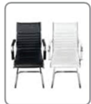
Chairs Arm DF-4b b) Black/White 40$