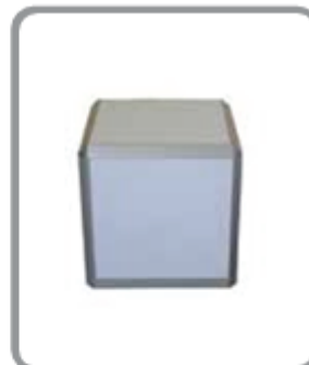
Podium DF-18a Exhibit base 500x500x500 32$