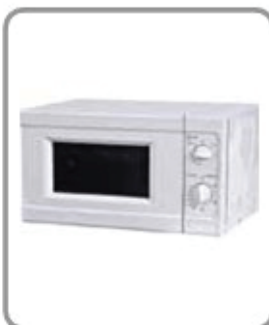
Microwave DF-32 50$