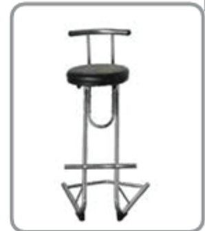
Stool w/Back Rest DF-26e Fixed Height chrome leg 30$